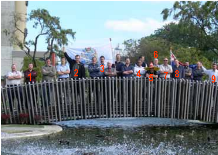
Roding staff were more than fairly represented in PNCC's 'Movember' effort!