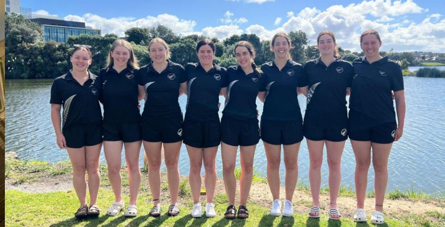
National League Champions