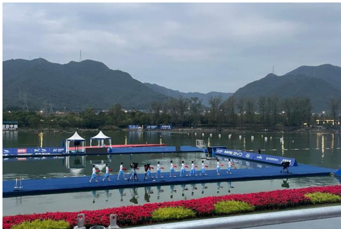
ICF Super Cup (4th Place)