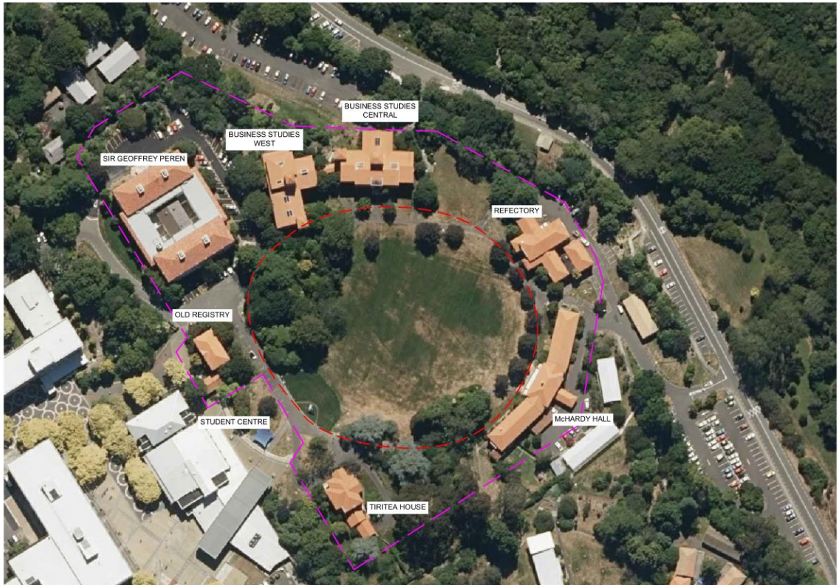
Map 19.1: Turitea Historic Area