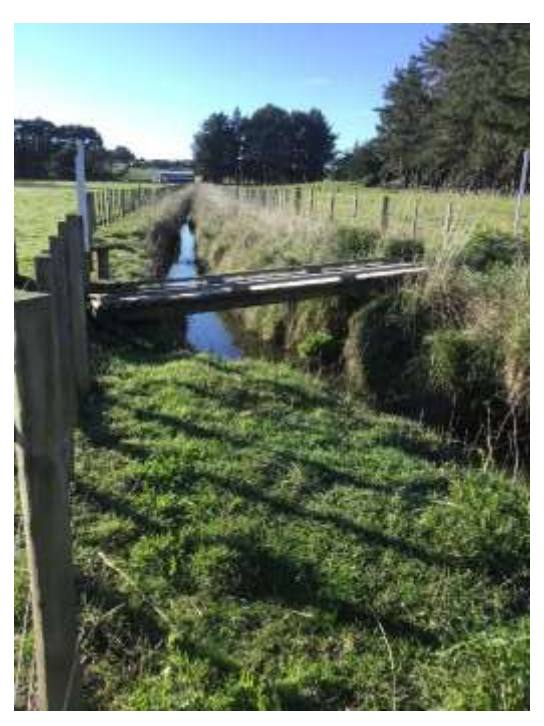
Image 6: Open channel section of the Northern tributary, upstream of the Designation Extent, with negligible flows.