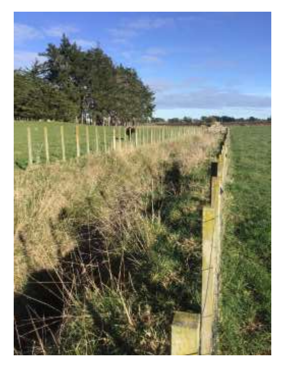
Image 5: Northern tributary of stream system 2, upstream of the Designation Extent. Note the artificially incised and straightened nature of the channel. However, the incision provides some shading and the stream is largely fenced throughout.

complexity. Where vantage was gained, water depth appeared to vary between 30 cm and 50 cm, and the wetted width ranged between 0.5-1 m. At the time of survey on 27 and 28 July 2020, there was no discernible flow.