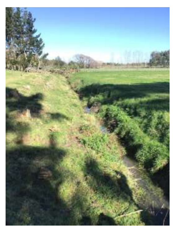
Image 3: Downstream extent of the northern tributary within stream system 2 which may be impacted. Note it is largely unfenced and unvegetated, though some small, isolated patches of vegetation do exist.

The northern tributary (Figure 2) of the Mangaone Stream catchment comprises a single channel which is approximately 835 m long that flows through the central portion of the Designation Extent. It is soft-bottomed throughout and typically comprises slow run habitat. Some incision was evident in the lower reaches (>0.5 m in places) which was also fenced to exclude stock. The middle and upper portions of the stream was unfenced meaning shallow, pugged banks dominated. Macrophytes (predominantly water pepper ( Persicaria hydropiper )) were mostly found in the lower reaches which also had some riparian vegetation. That vegetation was predominantly flax ( Phormium tenax ) and has been planted throughout the lower reaches. However, where present, the riparian vegetation lacked the complexity needed to provide material benefits to the stream (other than serve as a barrier to stock). The stream typically varied between 0.5-1 m wide in the lower reaches before becoming more homogenous in the middle and upper reaches (typically 0.5 m wide). Depth varied between 30 cm and 60 cm throughout the surveyed and accessible reach(es).