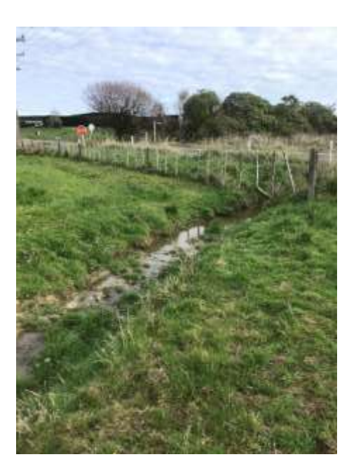
Image 2: Ephemeral flow path immediately upstream of Clevely Line. Note the ponding upstream of the small culvert.