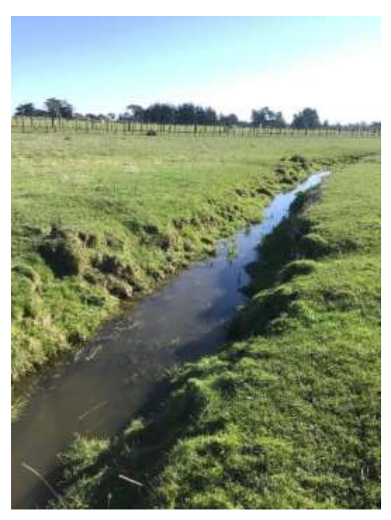
Image 4: Typical upper reach of the northern tributary of stream system 2. Note the absence of riparian vegetation and fencing.