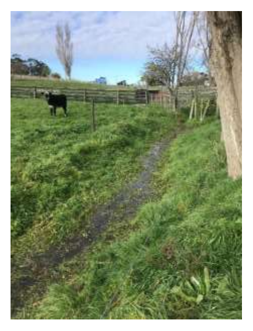
Image 1: Ephemeral flow path within stream system 1 near Te Ngaio Road. Note the fencing either side of the stream has been in place <2 years.

The single, central channel downstream of Te Ngaio Road could not be accessed for survey. This channel was noted to be a modified channel, with oxbows that were apparent on aerial photographs as having been straightened.