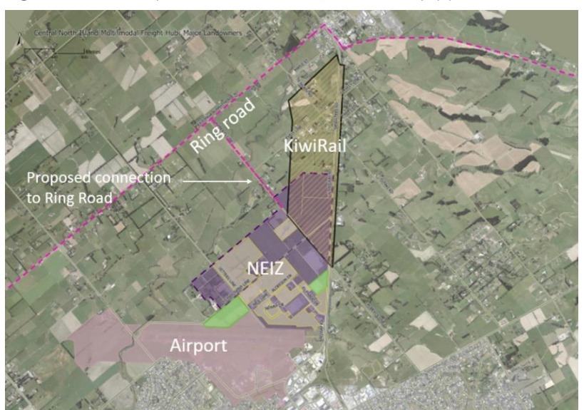
Figure 1 Aerial map of Central NZ Distribution Hub (approximate boundaries)

19. The Central NZ Distribution Hub is located in the Bunnythorpe area and encompasses the North East Industrial Zone (NEIZ), Palmerston North Airport and the planned KiwiRail Freight Hub, with connections into the future Regional Freight Ring Road. Once the KiwiRail facility is developed, the Central NZ Distribution Hub will be the only location in New Zealand with rail, road and air connectivity provided in one precinct.