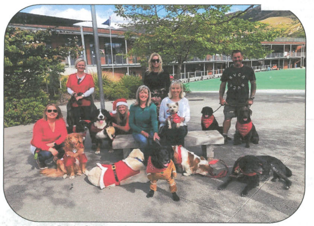
Dog day Christmas Party at Remarkables Primary

Sharing their Christmas love and enthusiasm in Queenstown in 2020.