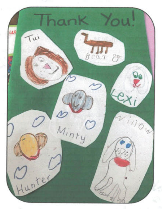
Special thank you cards from the children