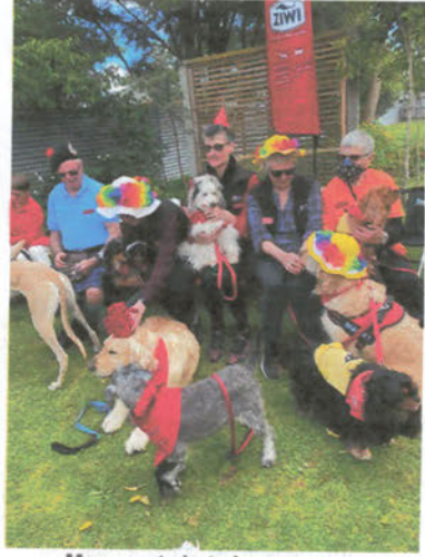
More party hats in groups