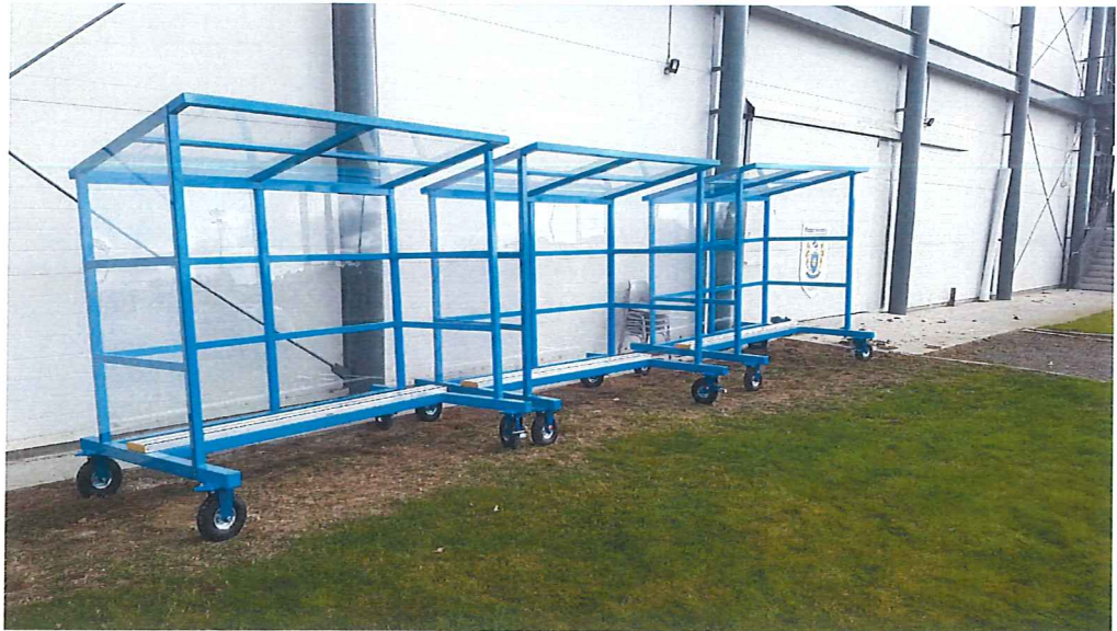
Figure 4: Portable shade structures