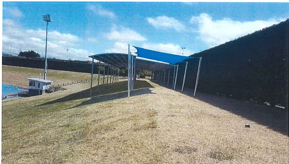
Figure 3: Spectator shade sail