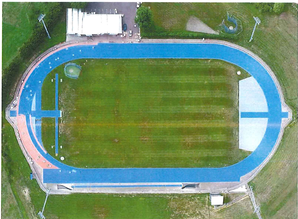
Figure 2: The replacement track surface being laid early 2018