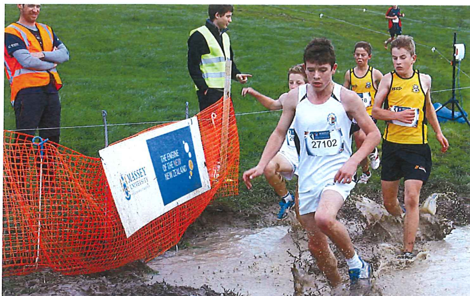
Figure 2: Super 8 Cross Country