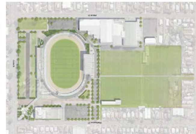
2019 Master Plan – Developed Design Changes