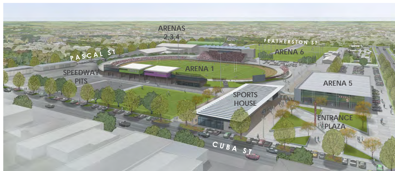
2017 Master Plan Vision