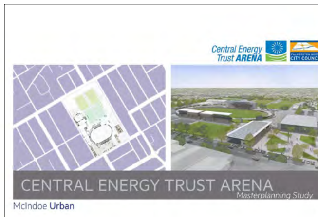
2017 Master Plan Document