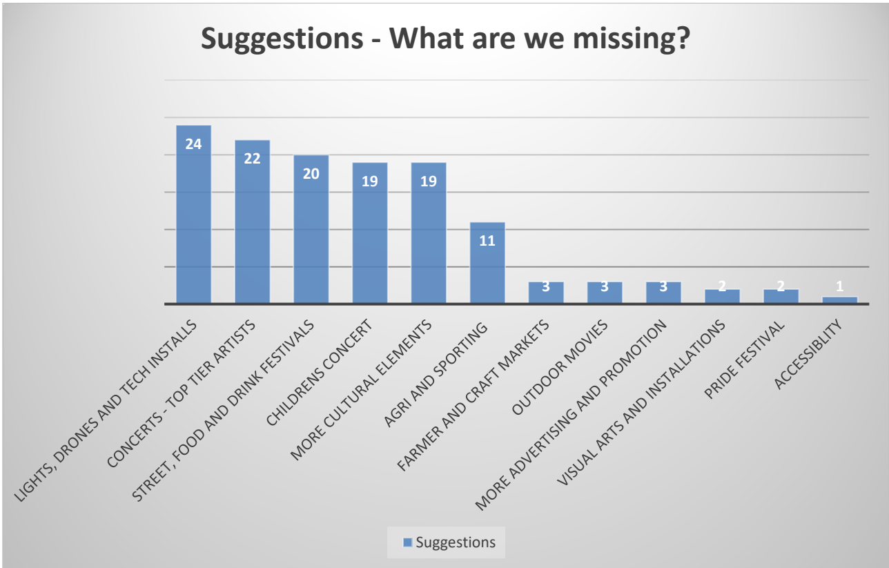
Figure 2-3: Suggestions