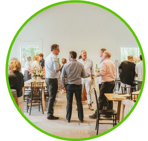
Facilitating conference and business events advisory group.