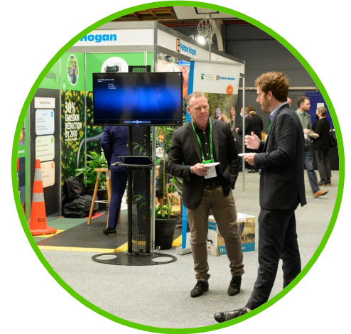
Exhibitions or trade shows