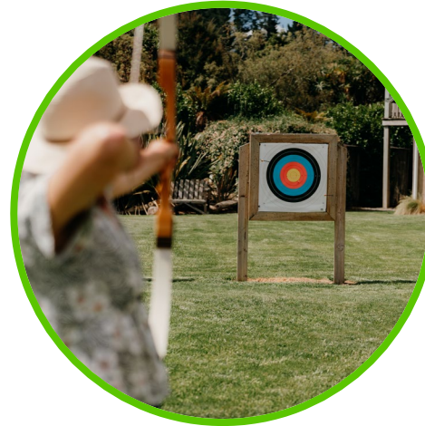
Providing marketing support and promotional assets