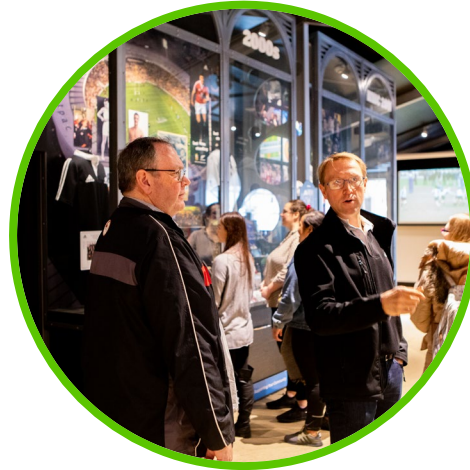
Organising and hosting famils