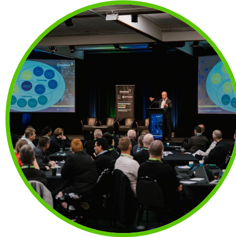
Conferences or conventions