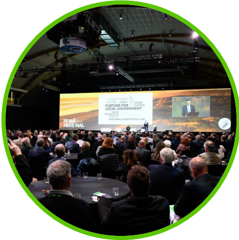
Bidding for business events