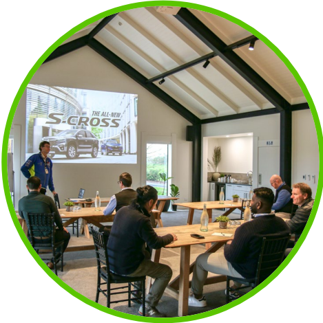
Meetings or seminars