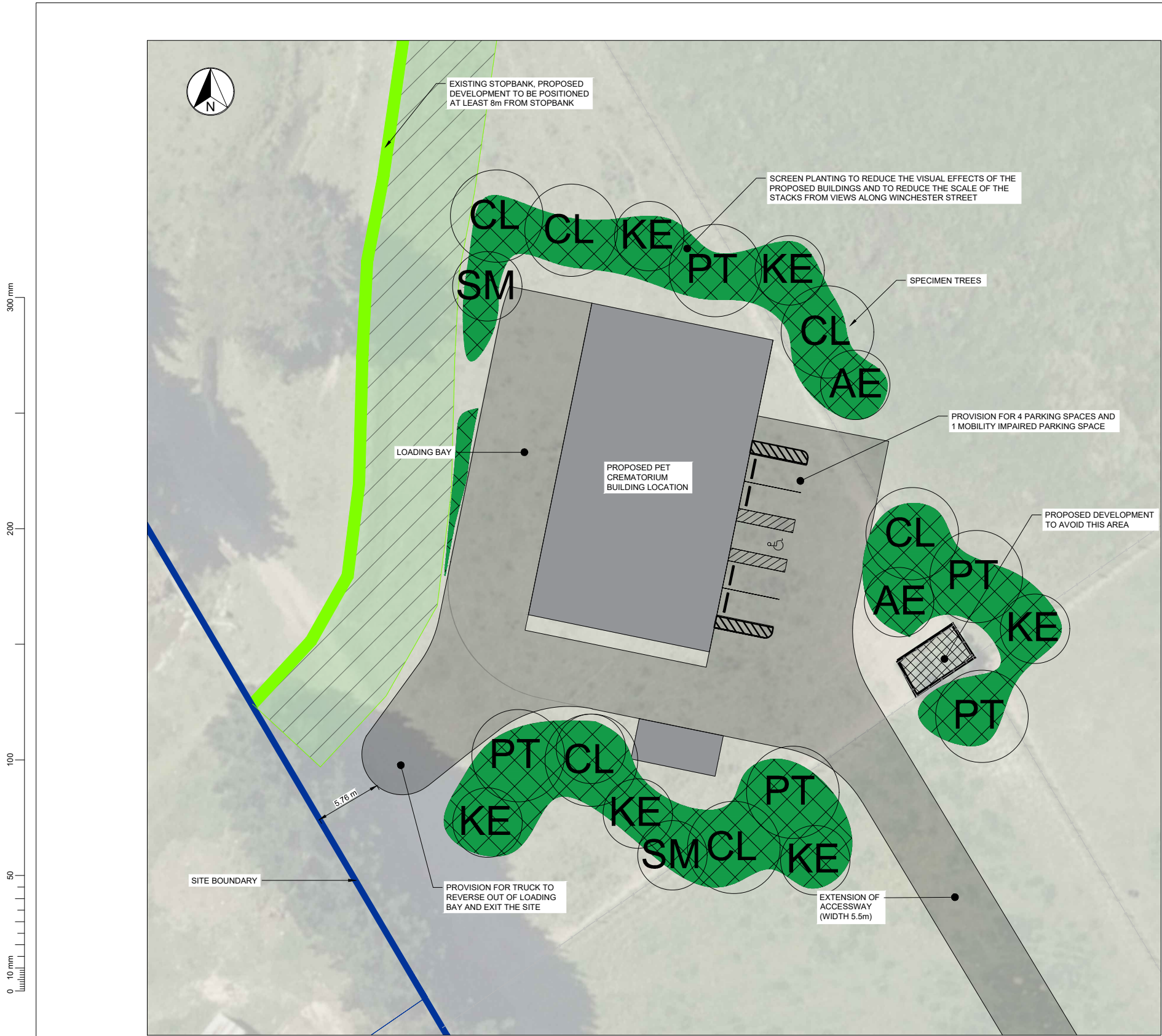
PROPOSED SCREEN PLANTING SCALE: 1:250 @A1