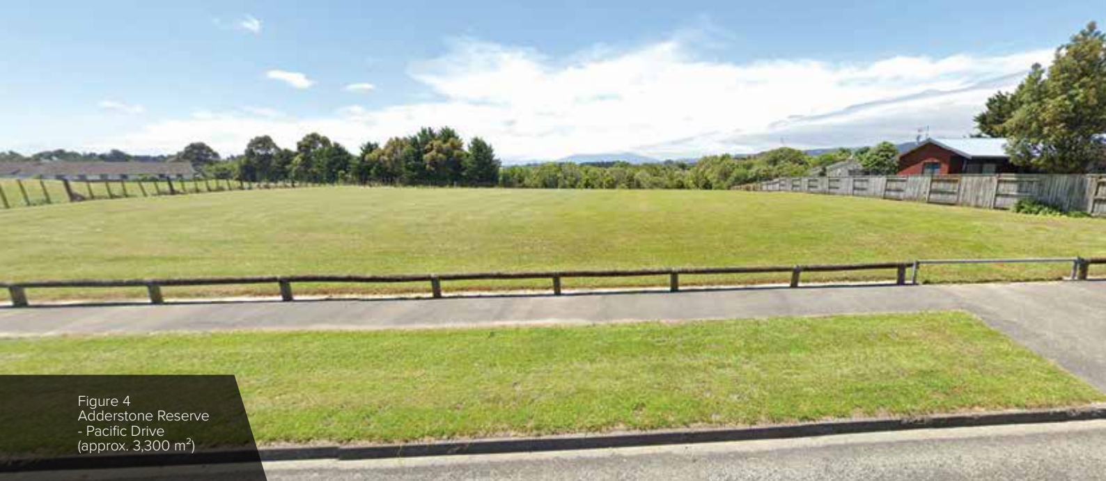
Figure 4 Adderstone Reserve - Pacific Drive (approx. 3,300 m 2 )