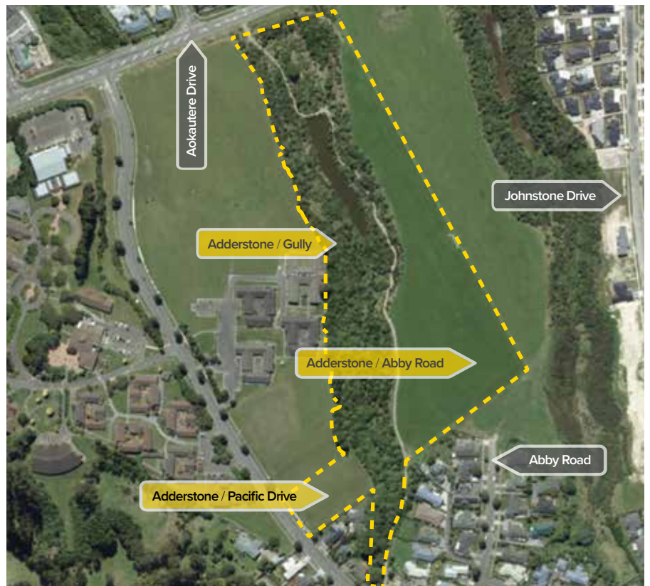
Figure 1 Adderstone Reserve landform areas.

1.3 While Adderstone Reserve Certificate of Title (WN 48B/598 - Part Lot 3 DP 68798) does not record the land as being subject to the Reserves Act 1977, research into the land's history shows that, in addition to the gully being planned as a reserve, an area of around 1 to 1.34 ha was intended to be a reserve, as also shown in Figure 2.