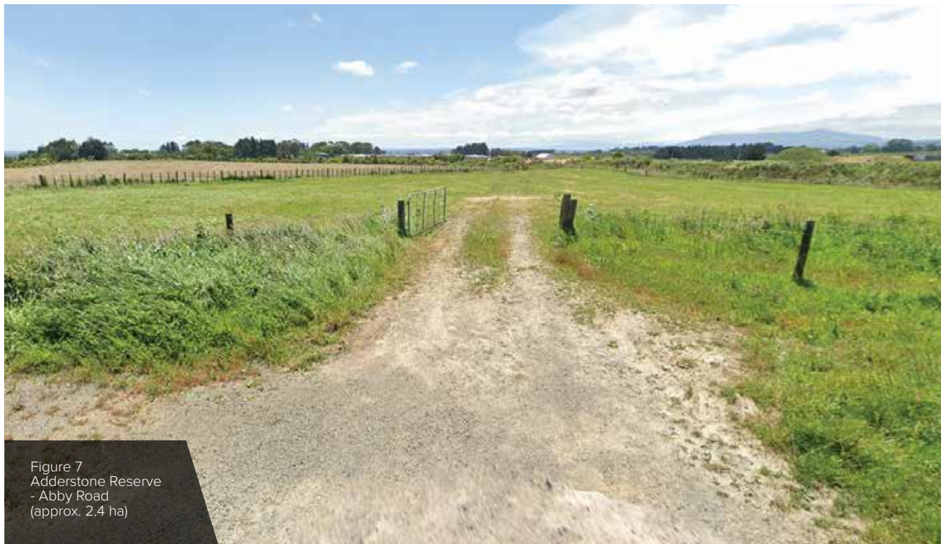
Figure 7 Adderstone Reserve - Abby Road (approx. 2.4 ha)