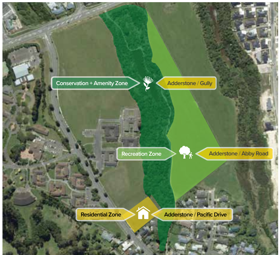
Figure 3 Current District Plan zoning for Adderstone Reserve

1.5 Council is consulting in accordance with the Reserves Act 1977.