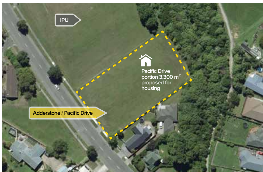
Figure 5 Adderstone Reserve - Pacific Drive (approx. 3,300 m 2 ) proposed for housing

3.6 Council has no development plans for this grassed portion of Adderstone Reserve off Pacific Drive and is proposing to dispose of it for housing.