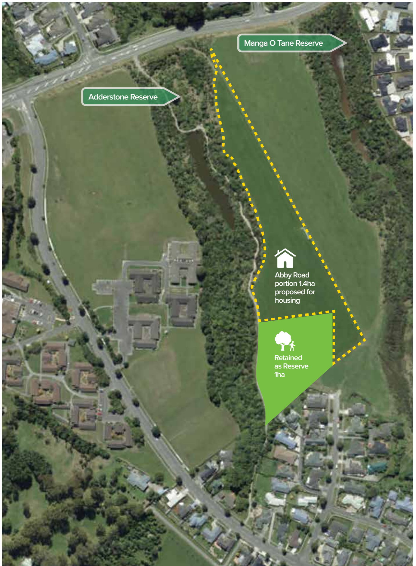
Figure 8 Adderstone Reserve - Abby Road (approx. 2.4 ha)