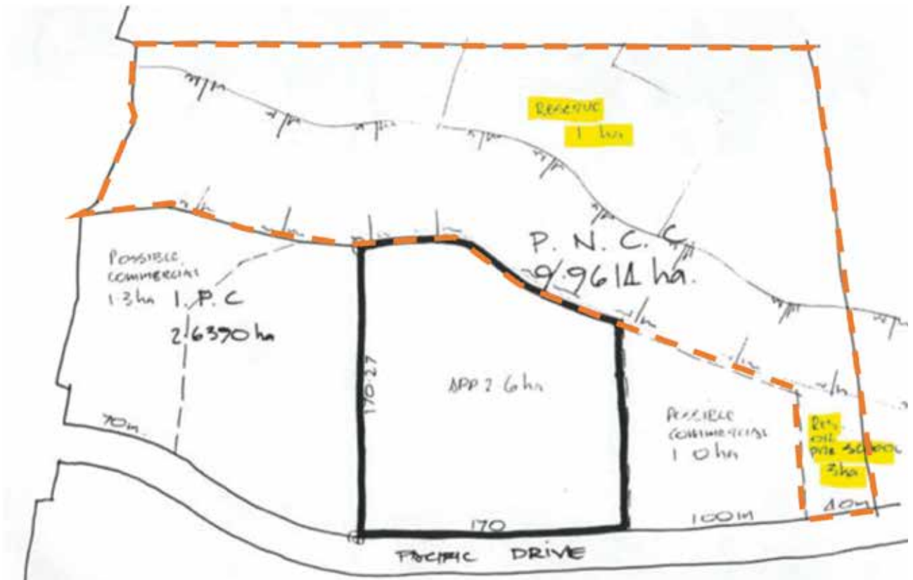
Figure 2 Adderstone - Historical Intentions 2 (highlights added).

1.4 Each of the three portions of Adderstone Reserve are currently zoned differently in the District Plan (Figure 3). The Pacific Drive portion of the reserve is currently zoned for housing, whereas the other two portions are a mix of Conservation and Amenity zone and Recreation zone.