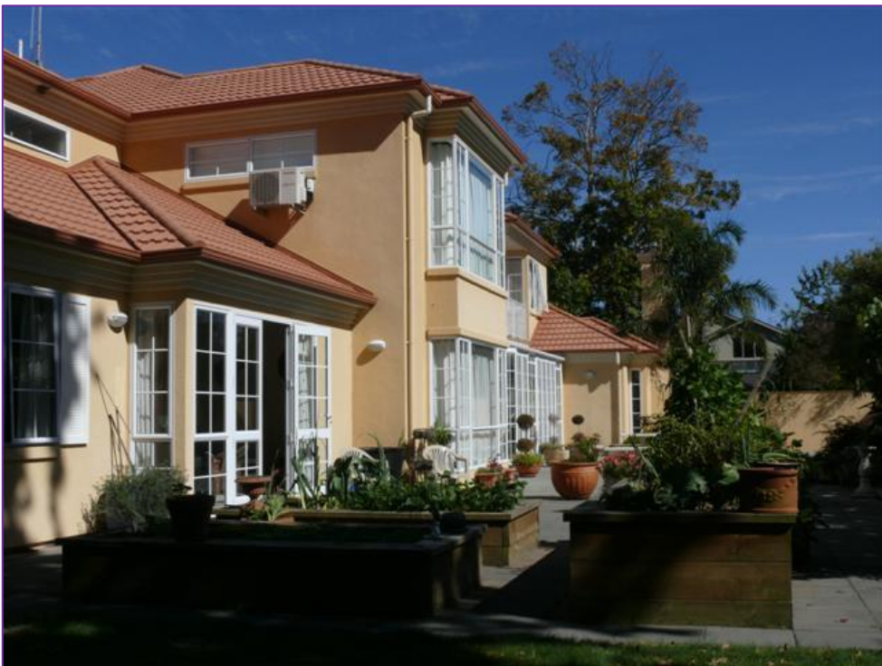
Figure 2 the house and grounds