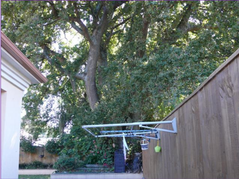
Figure 1, The tree and the garden