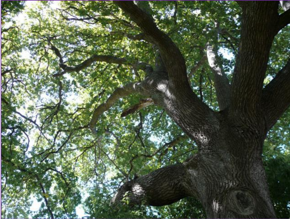
Figure 3. Healthy Crown