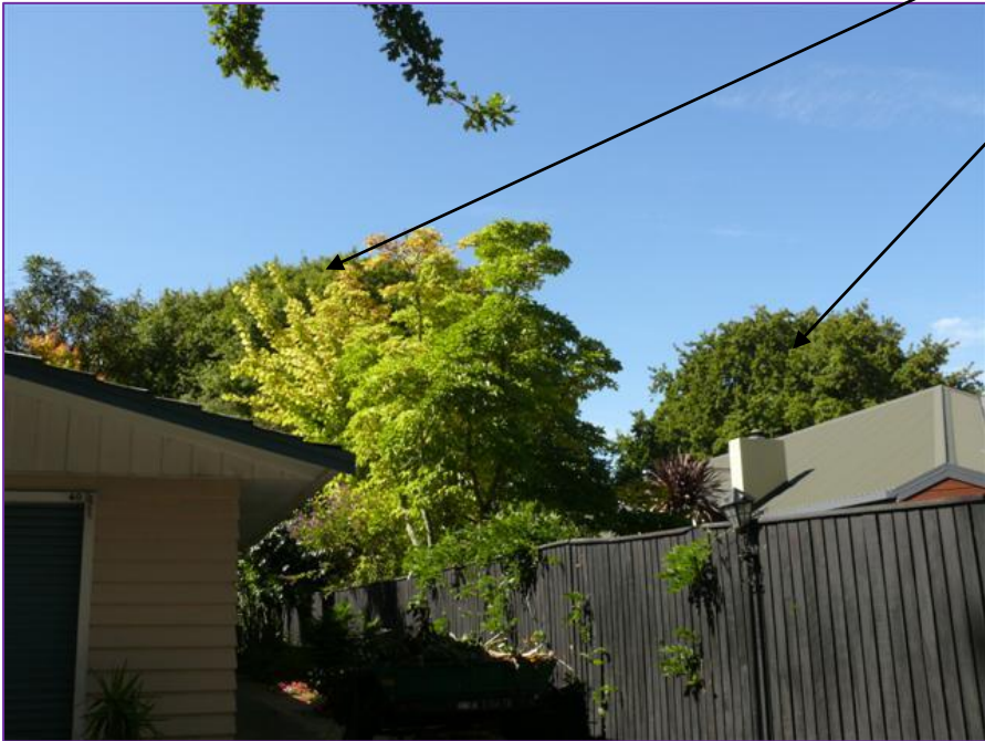
Figure 1. Crowns of two notable trees 38 Ihaka Street and 1 Pastoral Lane