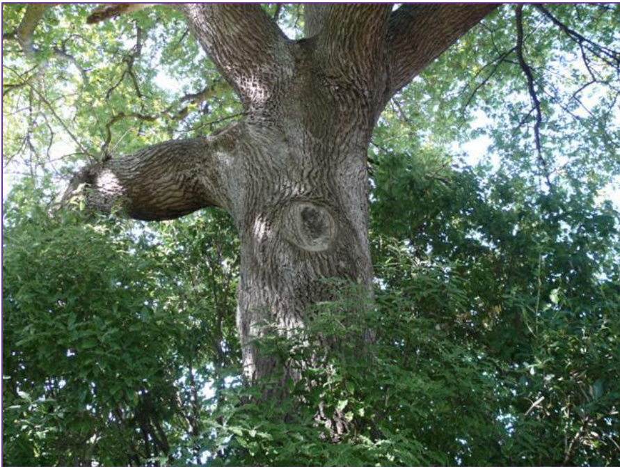
Figure 2. Looking into the crown