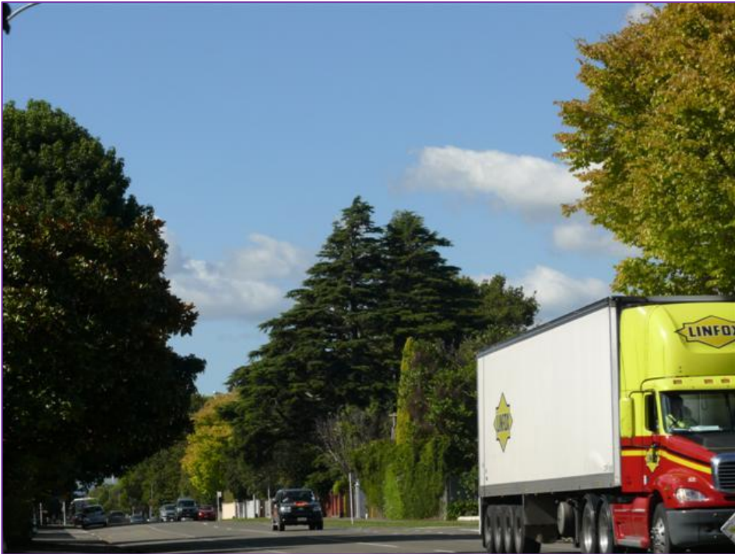
Figure 3 and fig 2 above, the trees dominate the street frontage