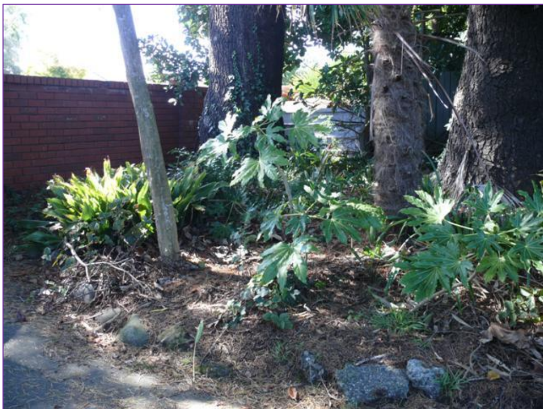
Figure 6, natural undergrowth