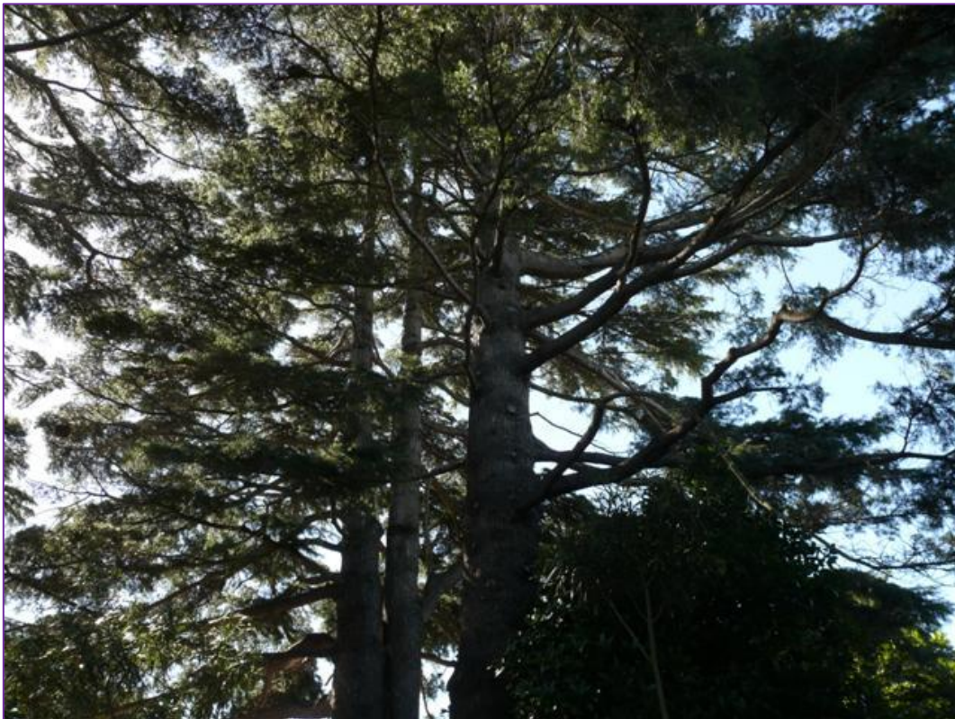
Figure 4, healthy canopy