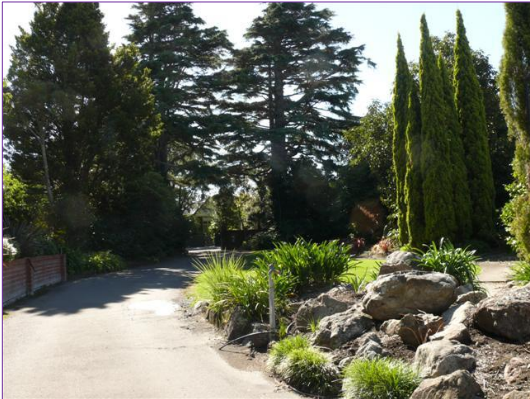
Figure 5, the trees in their garden setting