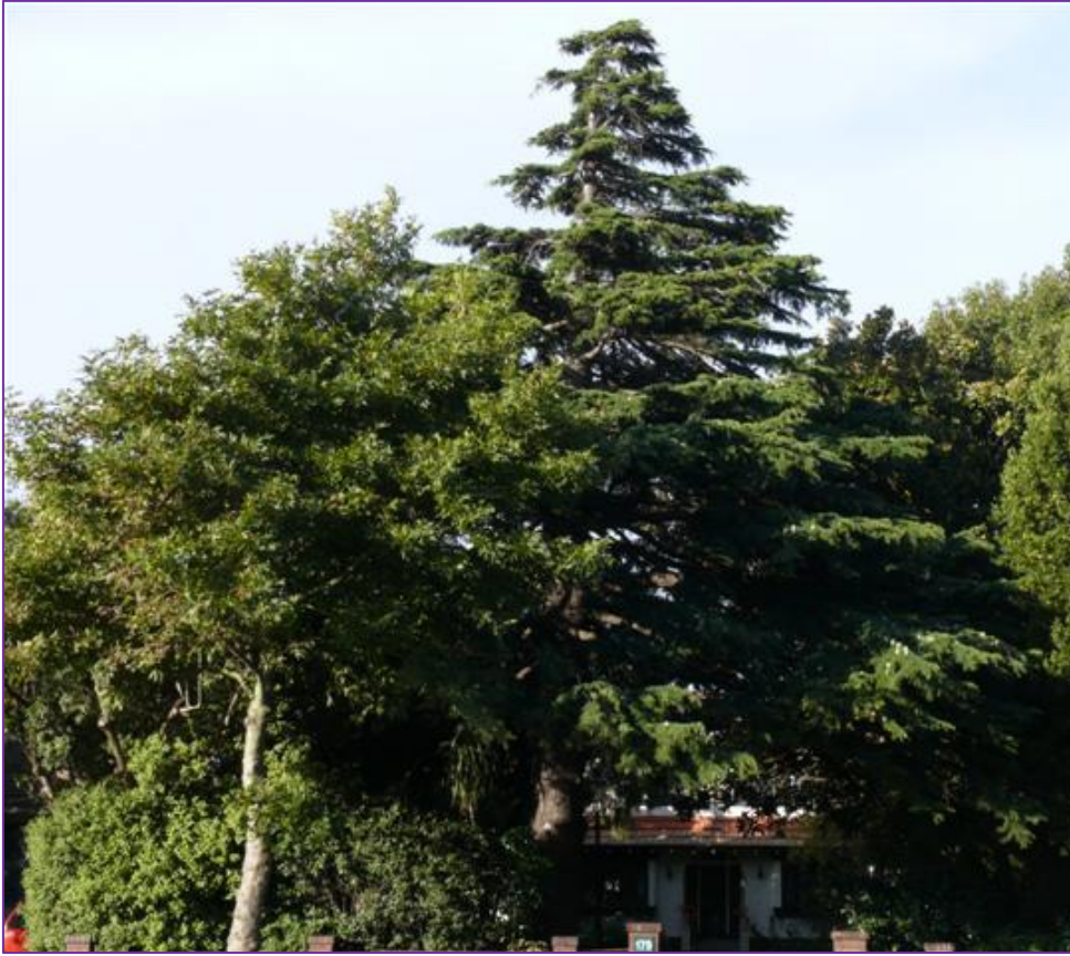
Figure 1 The tree and the front of the garden