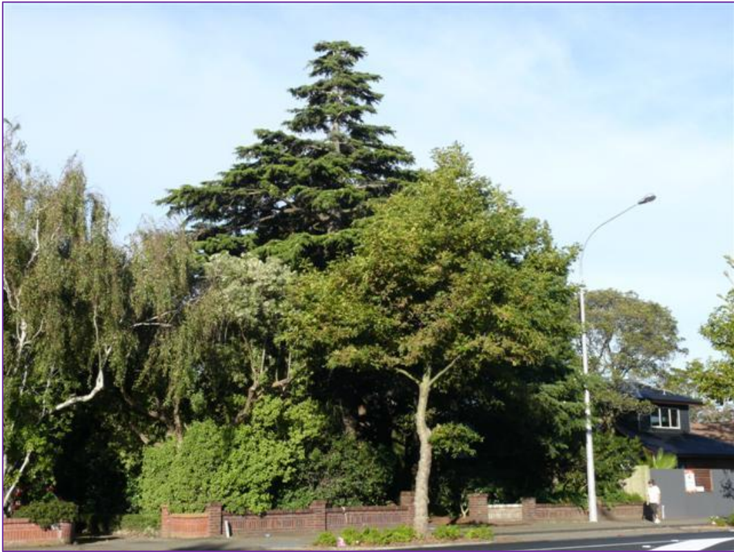
Figure 3. From across the street.