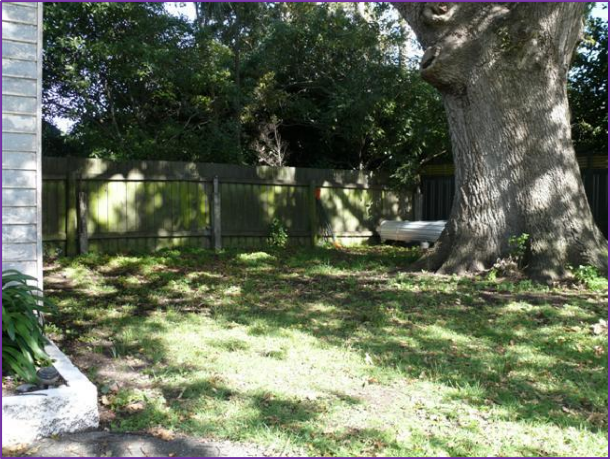
Figure 4, the trunk and buttresses