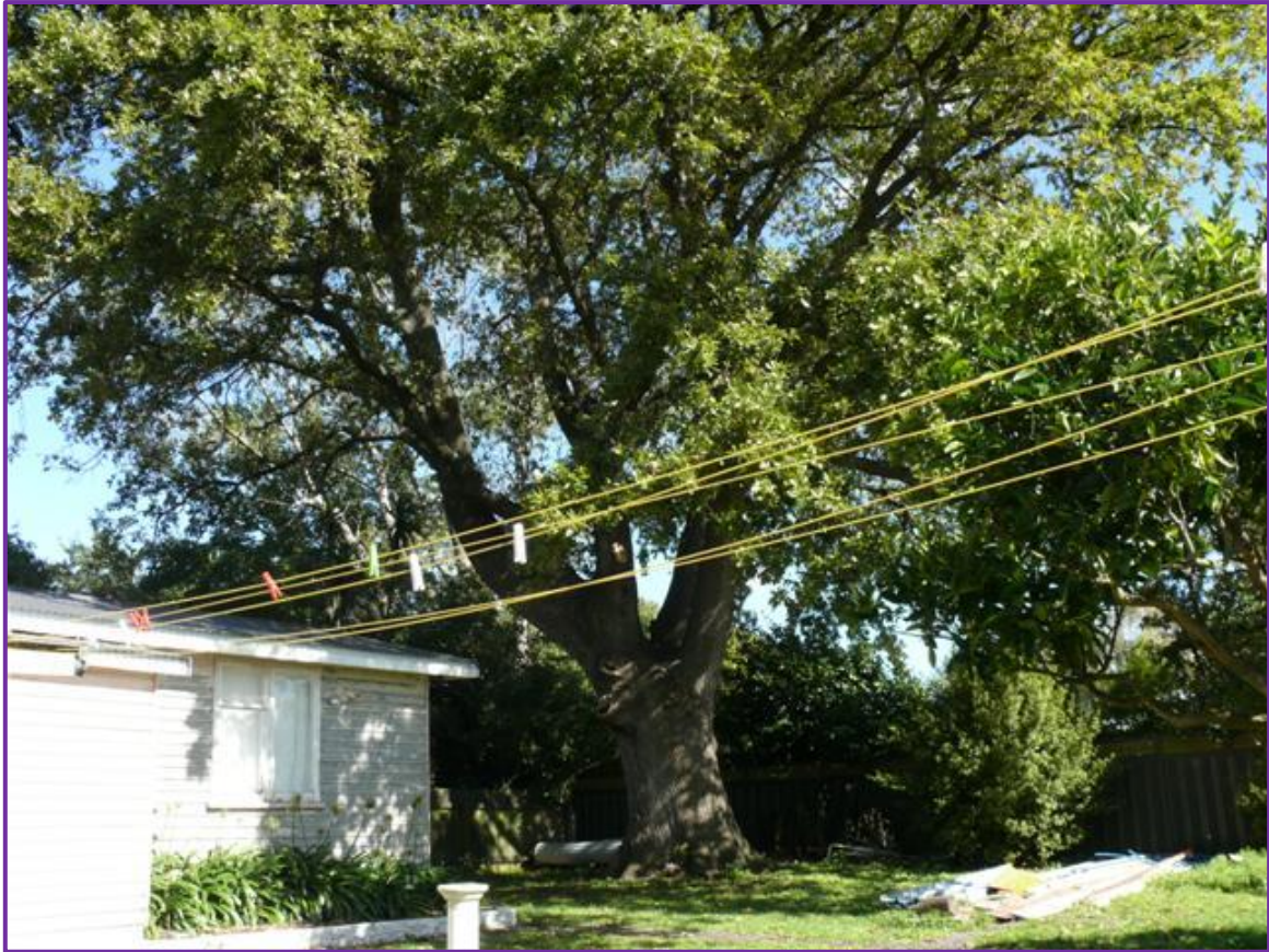
Figure 3, the Tree and the garden flat