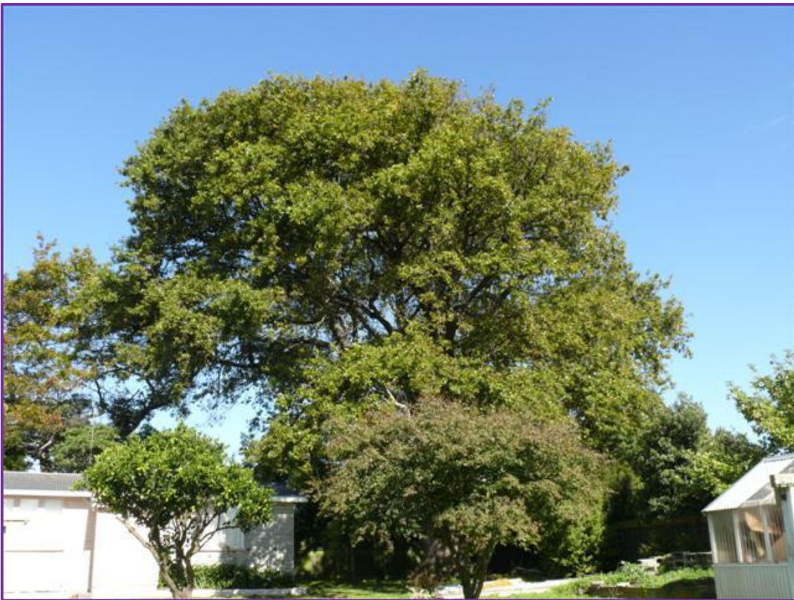
Figure 2, the oak in the rear garden