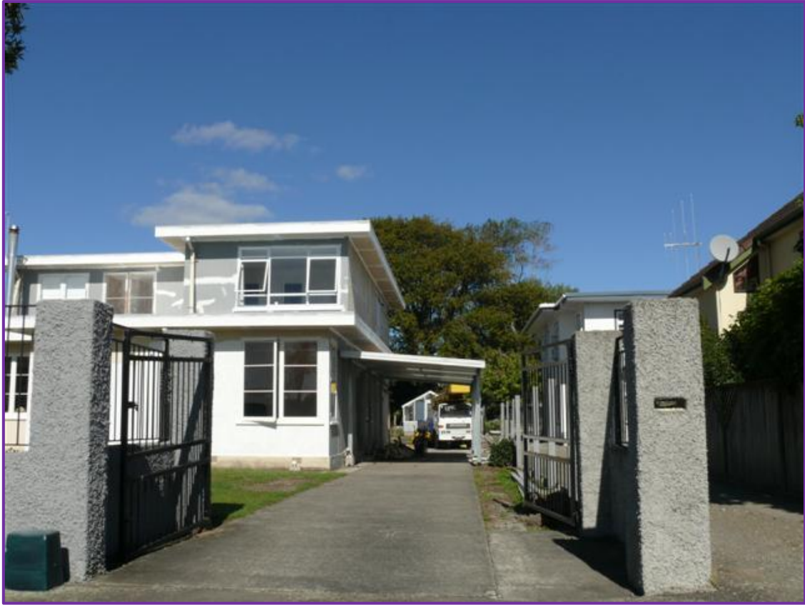
Figure 1, the oak behind the house